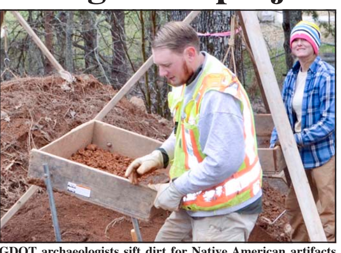
GDOT archaeologists sift dirt for Native American artifacts ahead of new road construction in Young Harris.

"Currently, the project is See Georgia 515 Project, Page 6A