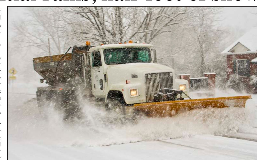
A county road truck plowing snow and spreading salt/gravel along Cleveland Street on Saturday