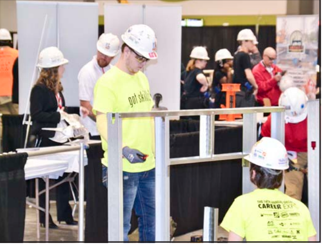
Woody Gap students have competed at a high level for several years in SkillsUSA competitions, as pictured here in 2018.