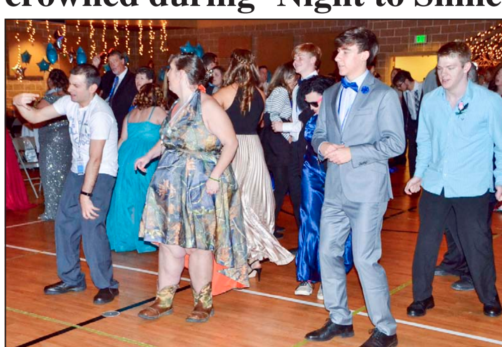
Area special needs residents had the time of their lives Friday night during the annual Night to Shine event at First United Methodist Church of Union County.